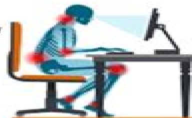
❌ WRONG SITTING POSTURE