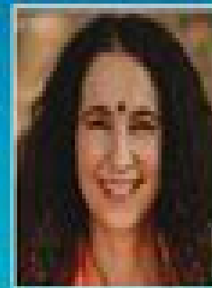
SADHVI BHAGAWATI SARASWATI