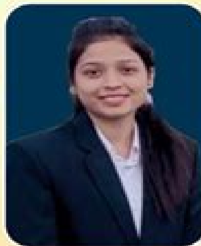
VISHVESHWARI IIT ROORKEE