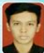
YASH IIT CHANBAD

6 std to 10 std (SSC,CBSE,ICSE), 11th & 12th (PCMB) & for Commerce & CA Foundation NIOS