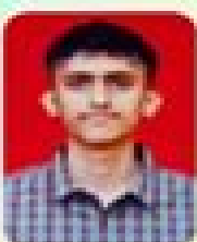
KRISHU 97.8% 100/100 (Maths)