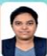
VAIDAVI 98.97% TIL