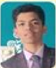
ATHARVA 95.4% 100/100 (Maths)