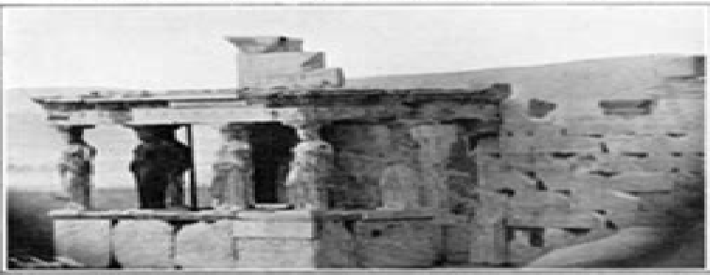
MANHATTAN ISLAND, NEW YORK, WITH THE CHURCH OF THE HOLY TRINITY IN THE FOREGROUND.

THE SCIENTIFIC AMERICAN SUPPLEMENT, Vol. 11, No. 1, 1895.