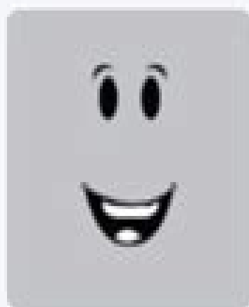
Joyful Smile 20