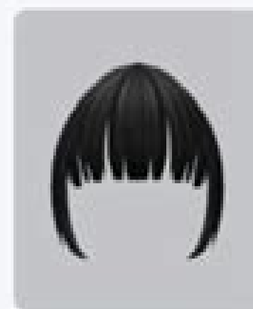
Cute Full Bangs (Black) By @xOrow 22