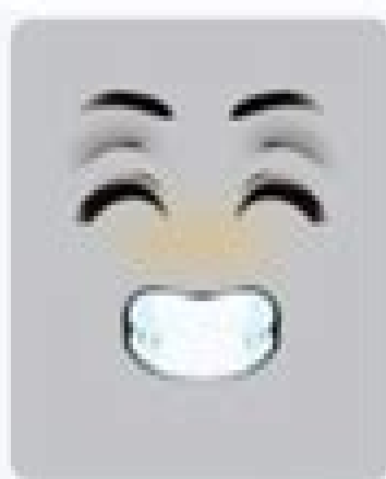
Big Grin - Tai Verdes 150