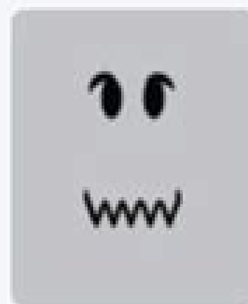
Squiggle Mouth 45