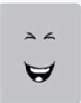
Laughing Fun 100