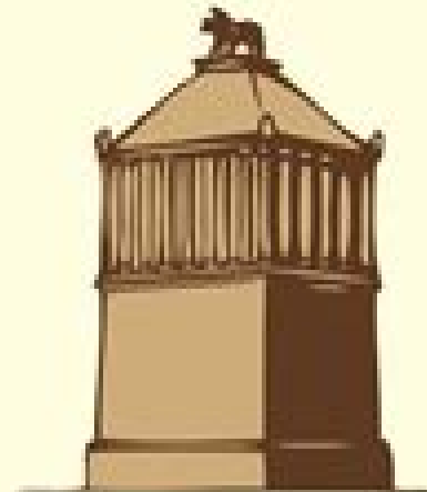
Mausoleum at Halicarnassus