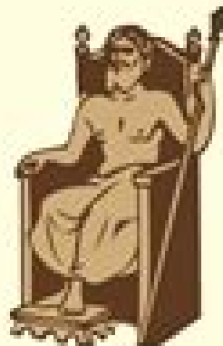
Statue of Zeus at Olympia