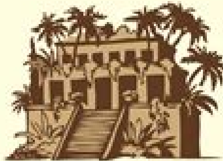
Hanging Gardens of Babylon