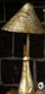
With Gift Guide from Real Simple , you can find the perfect gift for everyone on your list.

Get the full story on the new Gift Guide from Real Simple and the Gift Guide from Real Simple .