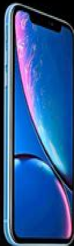
iPhone X ®