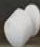
Presence Sensor FP300