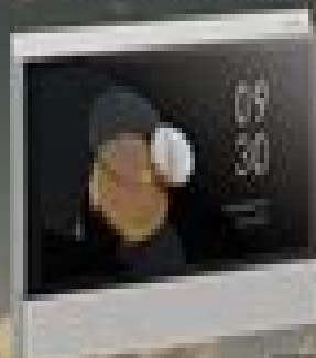
Panel Hub S1 Plus US