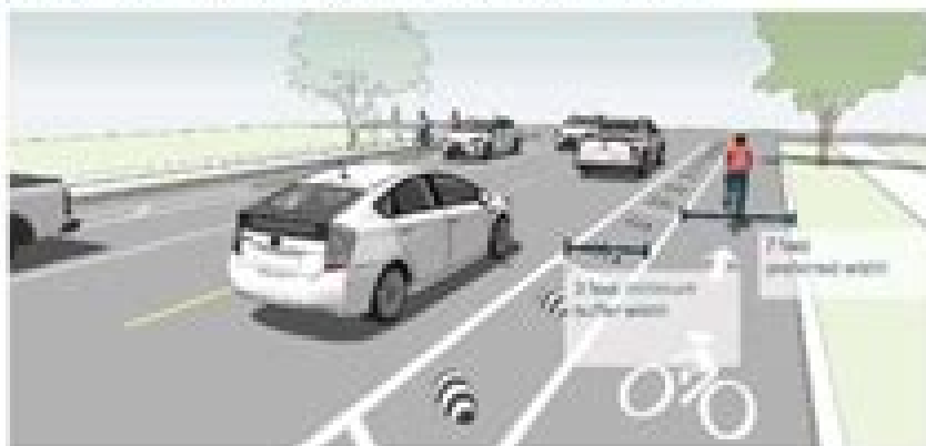
ONE-WAY SEPARATED BIKE LANE