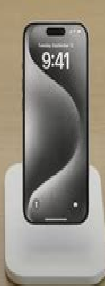
iPhone 15 Pro 6.1" Display