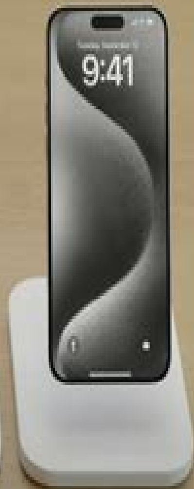
iPhone 15 Pro Max 6.7" Display