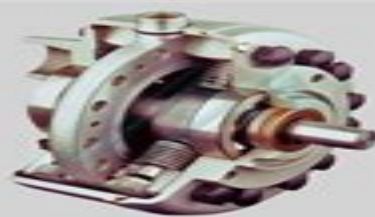
Radial Piston Pump