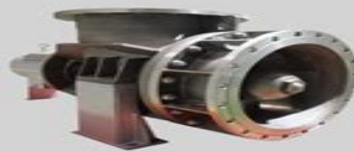
Axial Flow Pump