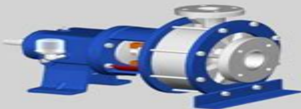
Radial Flow Pump