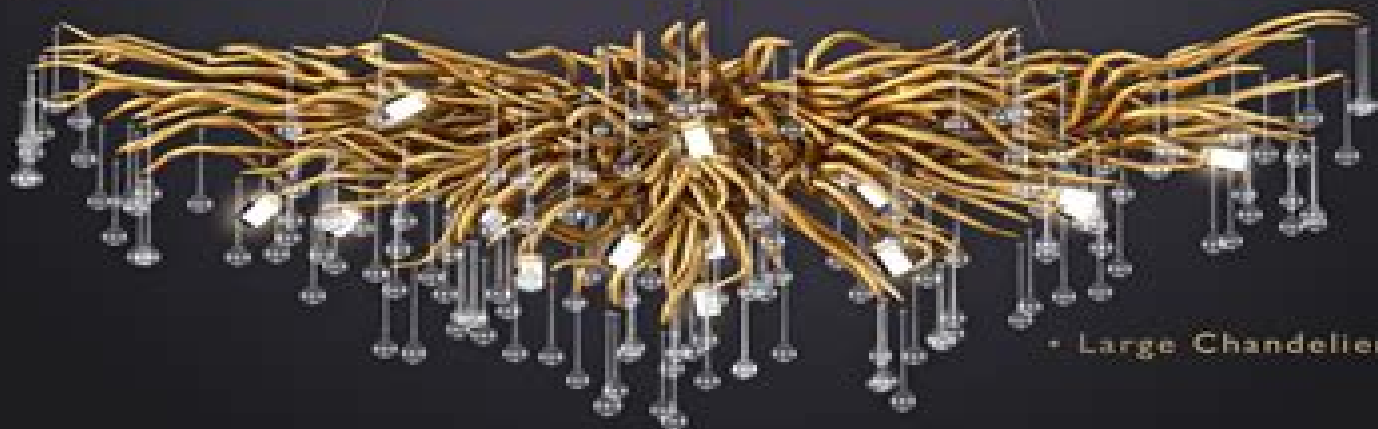
• Large Chandelier