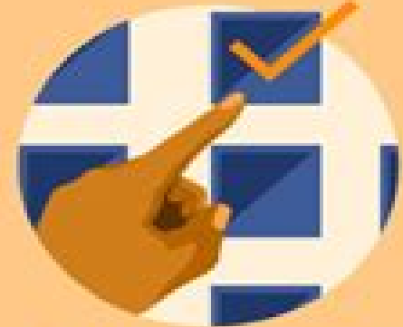
3. Gut instincts