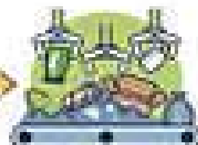
SORTING AND SEPARATION