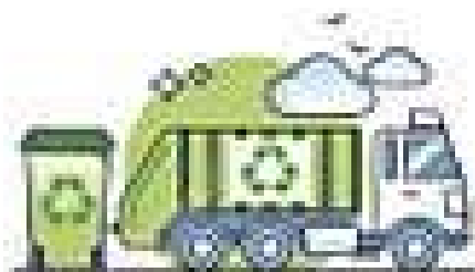
COLLECTION OF WASTE