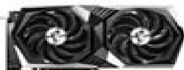
AMD RADEON RX 6900 XT