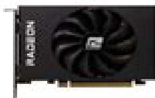
AMD RADEON RX 6900 XT