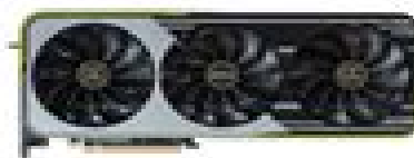
AMD RADEON RX 6900 XT