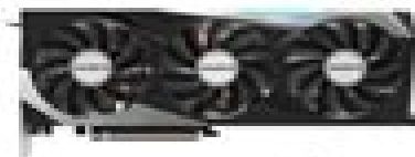
AMD RADEON RX 6900 XT GAMING OC