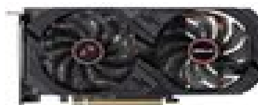
AMD RADEON RX 6900 XT