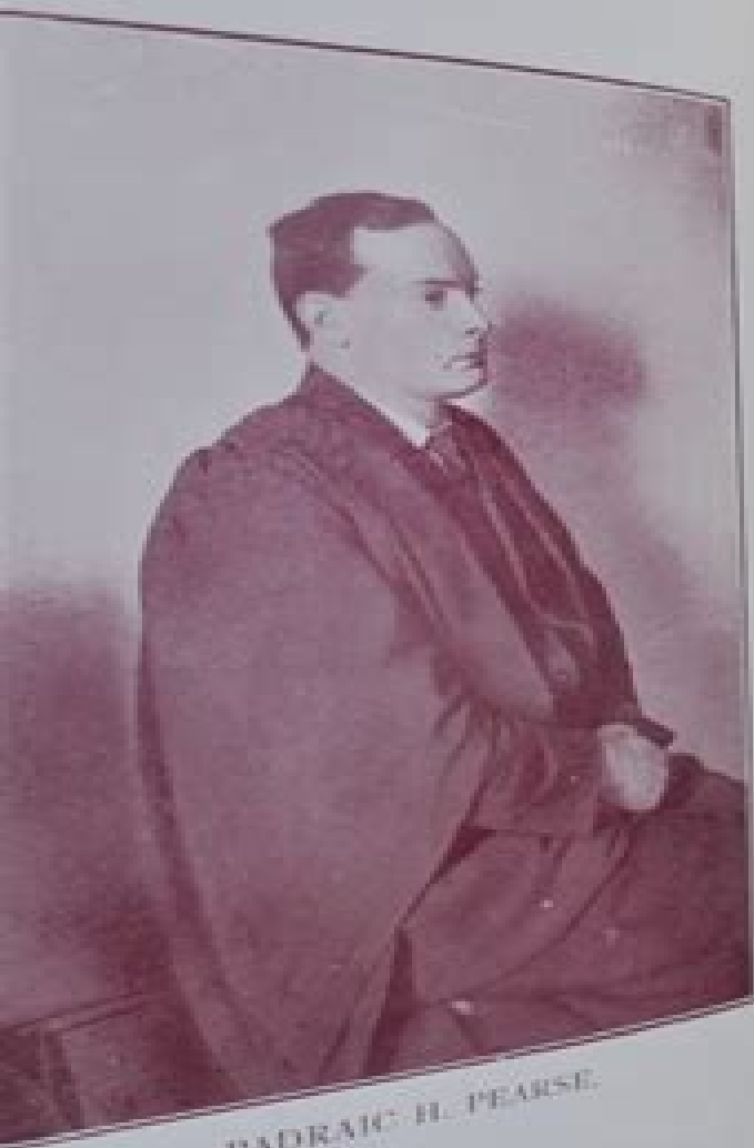
PADRAIC H. PEARSE.

THE PHOENIX PUBLISHING CO., LTD DUBLIN CORK BELFAST