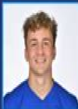
GRIFFIN VOW (F)