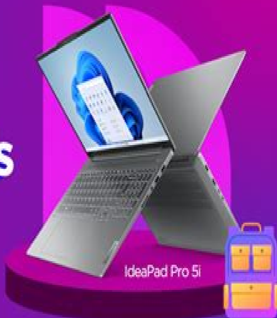
IdeaPad Pro 5i

Make the everyday easier with Windows 11