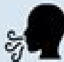
Humming Bee Breathing