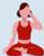
Alternate Nostril Breathing