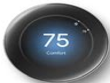
Nest Learning Thermostat (4th gen)