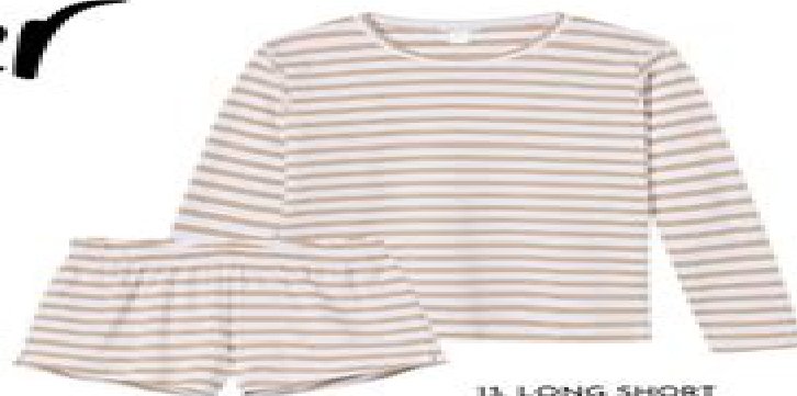
13. LONG SHORT PAJAMA SET