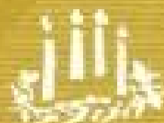
CORONA DE ADVIENTO