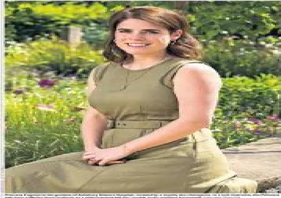
Princess Charlotte, pictured here, has spoken about her struggles with scoliosis, a condition that affects the spine.