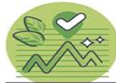
PLAN ACCORDING TO TRESHOLDS