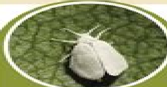
WHITEFLY SAP-SUCKING INSECT