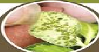
APHIDS SAP-SUCKING INSECT