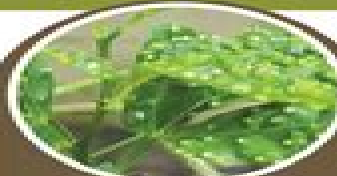
PSYLLA SAP-SUCKING INSECT