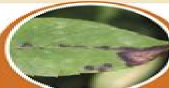
BLACK SPOT FUNGAL DISEASE