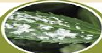
POWDERY MILDEW FUNGAL DISEASE