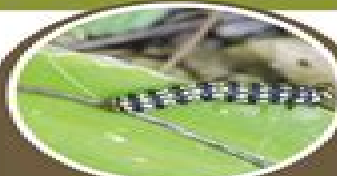
LILY BORER CATERPILLAR