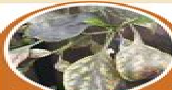
RED SPIDER MITE SAP-SUCKING INSECT