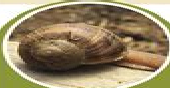
SNAILS & SLUGS MOLLUSCS