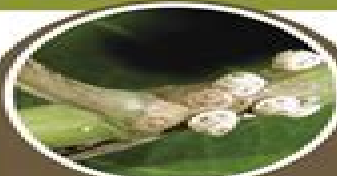
SCALE SAP-SUCKING INSECT