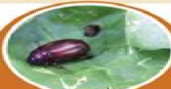
CHAPER BEETLE LEAF-EATING INSECT