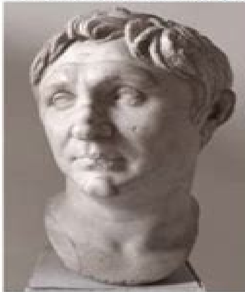
Gnaeus Pompeius Magnus