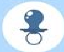
CHILDREN UNDER 14