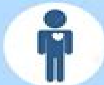
PEOPLE WITH HEART DISEASE