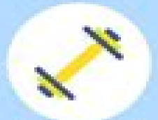
AVOID EXERCISING OUTDOORS