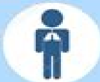
PEOPLE WITH LUNG DISEASE