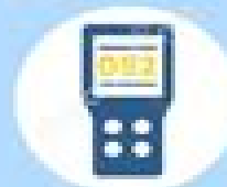
MEASURE POLLUTION LEVEL IN YOUR AREA