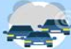
AVOID HIGH TRAFFIC ROADS