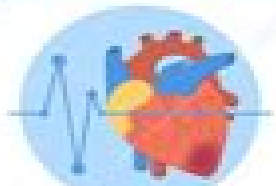
STRESS TO HEART