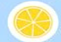
EAT FOOD FULL OF VITAMIN C