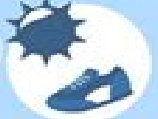
WORK OUT IN THE MORNING