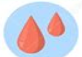
HARM TO BLOOD