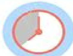
SHORTENED LIFE SPAN