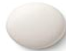
Nest Temperature Sensor (2nd gen)

Mounting screws and wiring labels (Not shown)