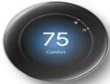
Nest Learning Thermostat (4th gen)