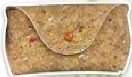
Innovative Packaging Solutions