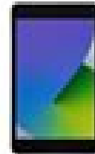
iPad mini (5th generation)