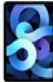
iPad Air (4th generation)