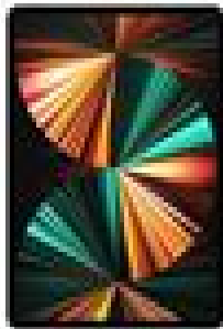
iPad Pro 12.9-inch (5th generation)