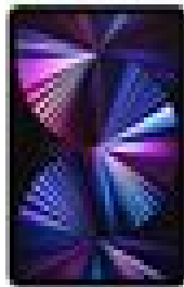
iPad Pro 11-inch (3rd generation)