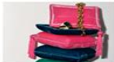
70+ Under-$100 Home, Beauty, and Fashion Gifts We Love