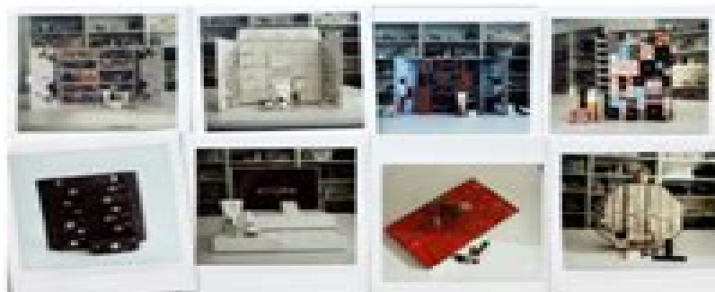
Shop the 40 Best Advent Calendars for Everyone on Your List