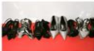
100+ Gifts for All the Women in Your Life, According to Testmakers