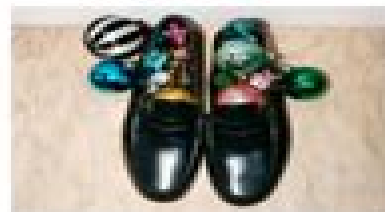
60+ Gifts for All the Men in Your Life, According to Testmakers