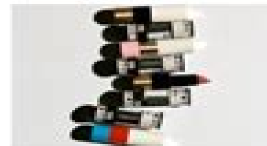
60+ Stunning Beauty Gifts to Give, According to Testmakers