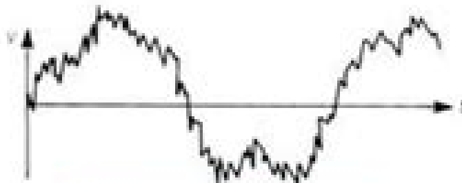
Original analogue signal with noise