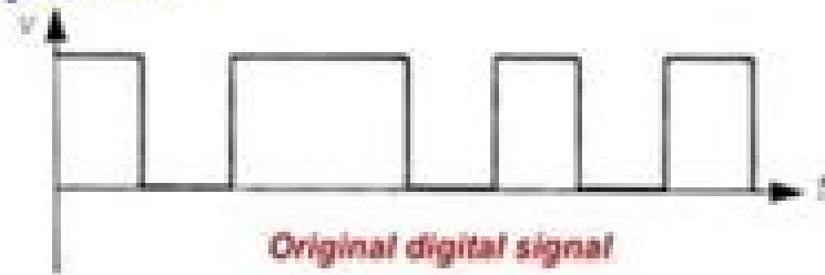
Original digital signal