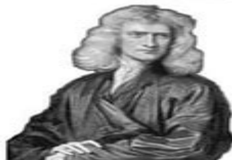
Isaac Newton (1666) Law of Universal Gravitation