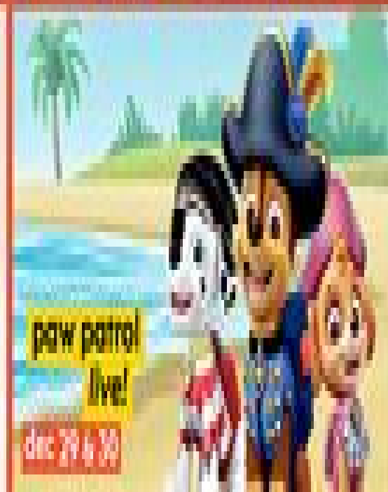
paw patrol live!