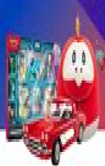
Select toys and collections