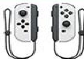
Joy-Con™ (L and R)