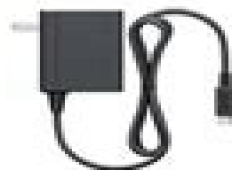
Nintendo Switch AC Adapter