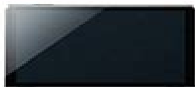
Nintendo Switch™ Console