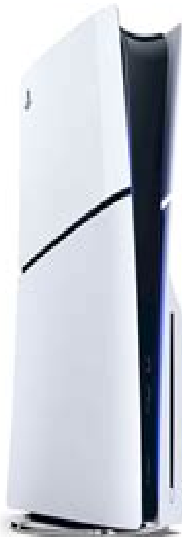
PlayStation 5 Slim