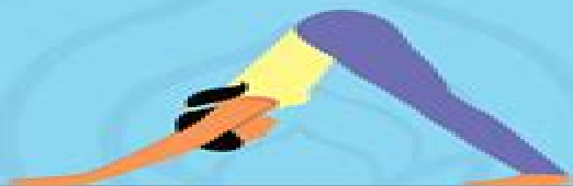
Downward Facing Dog