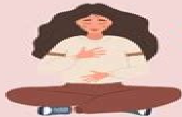
1. WARM-UP: PILATES BREATHING