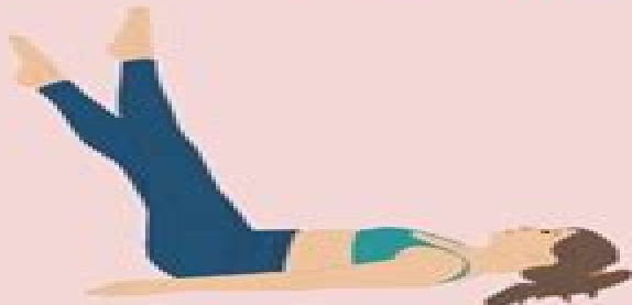
5. THE HUNDRED