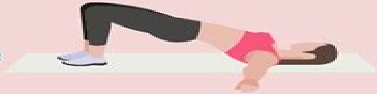
2. PILATES BRIDGE