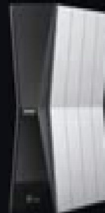
Aginet Wi-Fi 7 for ISP