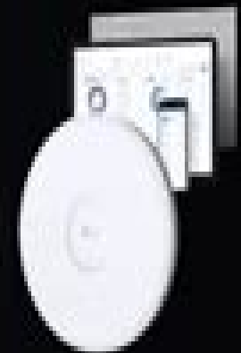
Omada Enterprise Wi-Fi 7 Access Points