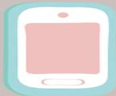
go screen free for 30 minutes