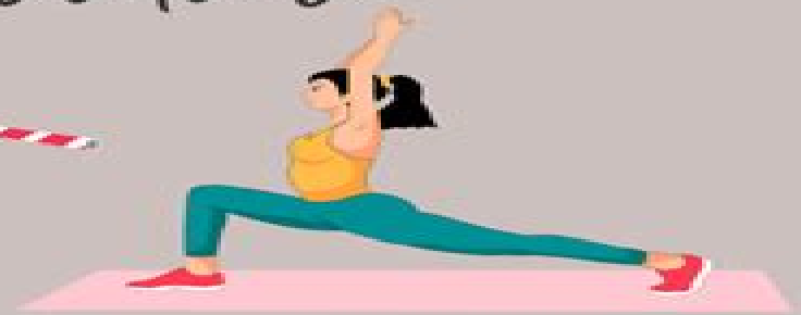
10 minute stretch