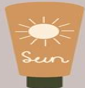
go out for fresh air