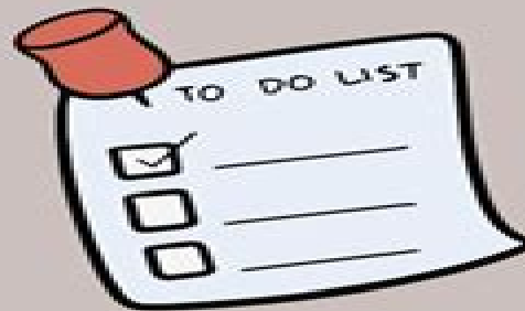
top priority to do list