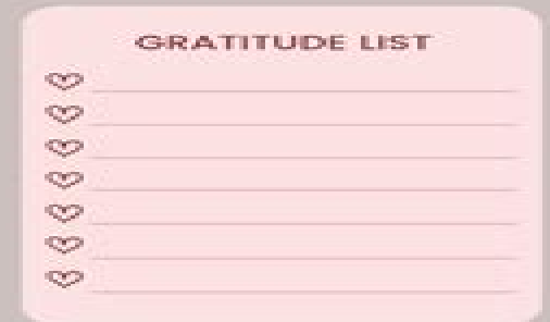
5 minute journal