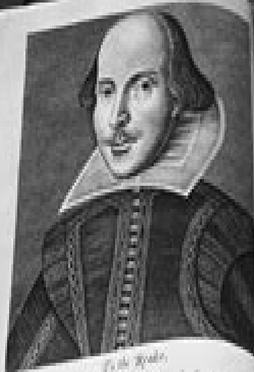
From the Quarto.