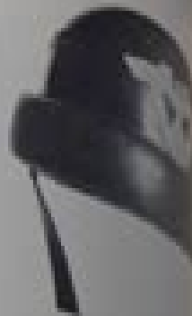
SECOND ISSUE POLICE CRASH Helmet Side View Seen Two and Three and Side View