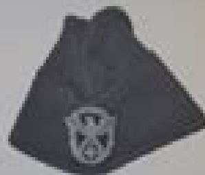
CIVIL POLICE OVERSEAS CAP Green with white Eagle on Black Back Panel