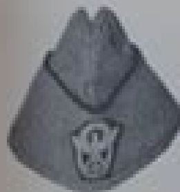
BERNSCHUTZ POLICE FIELD HAT Gray with white Eagle on Black background