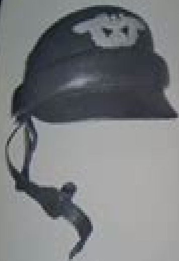
SECOND ISSUE CIVIL POLICE CRASH HELMET Seen in above two views and side view