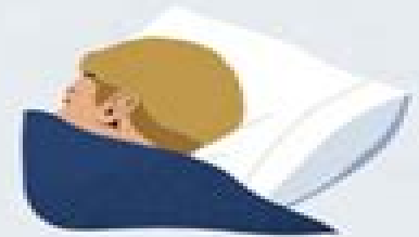
Loss of interest in masturbation