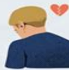
Experiencing distress and relationship difficulties due to symptoms