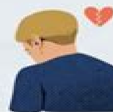
Experiencing distress and relationship difficulties due to symptoms