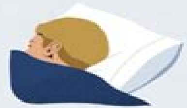
Loss of interest in masturbation