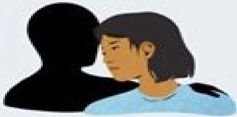
Reduced sexual arousal and receptiveness