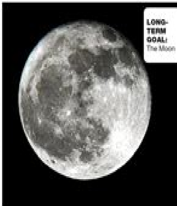
LONG-TERM GOAL: The Moon

"This means extracting water and oxygen from the rocks and lunar soil, but it also means making physical objects using those very same rocks and soil."