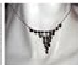
SPARKLING SCIENCE: "Moon pearls" made from simulated lunar dust