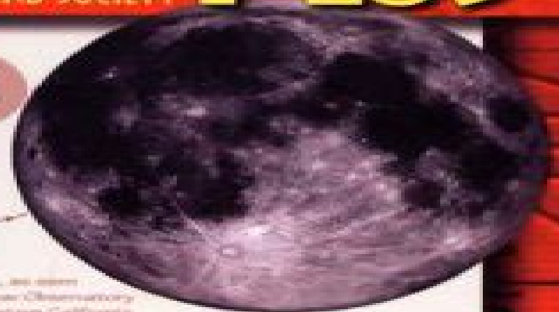
A full moon, as seen from Palomar Observatory in southeastern California