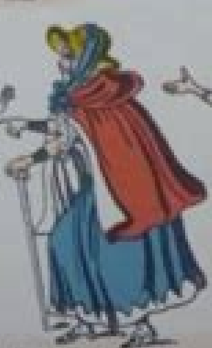
Queen Mother or Lady