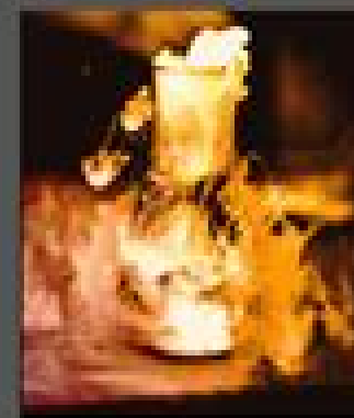
sodium in water